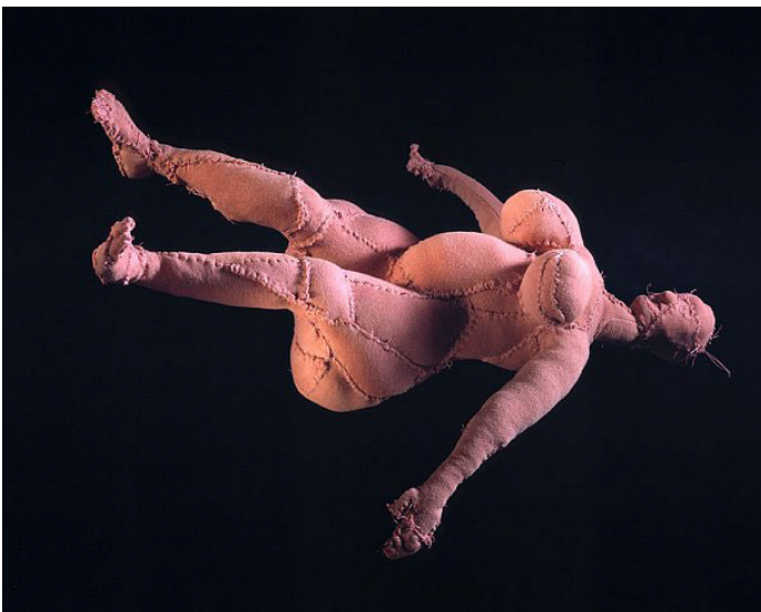
Top Left and Right: Claes Oldenburg Bottom Left: Louise Bourgeois